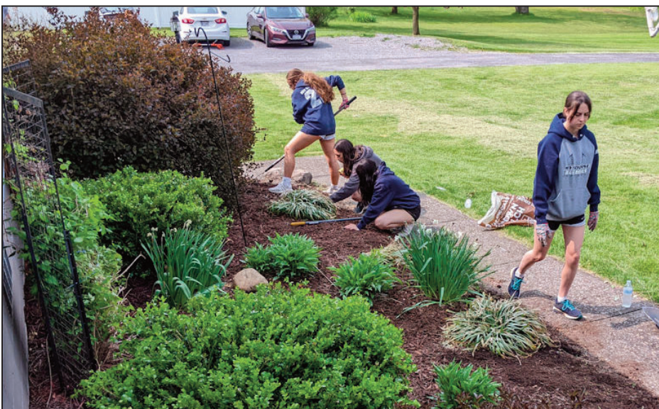
Honor Society Students from Mynderse Academy spent a day in the spring of 2023 working on our landscaping.