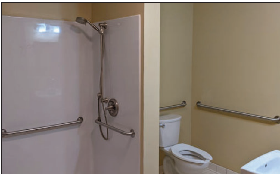
The roll-in shower in our newly renovated bathrooms

The Memorial Garden, which has been planned for a few years, is near completion.